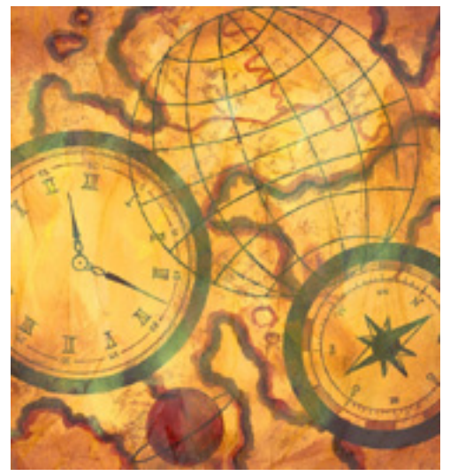
Creativity goes a long way on your commute.