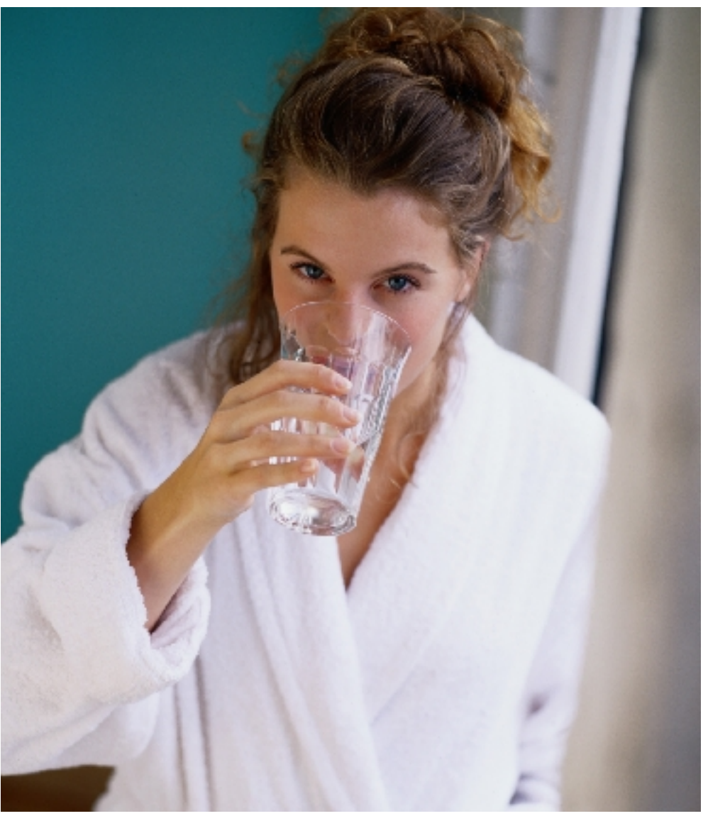
Drinking plenty of water after a massage is important for helping wash toxins from the body.